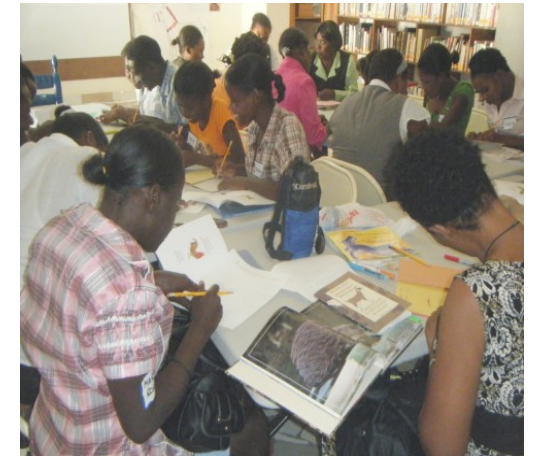
Teachers study picture books

Project Partners: SC Upstate Episcopal Diocese, FOKAL, Haïti: Fondation Connaissance et Liberté, Zanmi Lasante/Partners in Health, Libraries Without Borders, UNESCO, the Alliance Française, Greenville French Underground, Clemson University, Novel Elan, Rotary District 7750, Upstate SC Churches